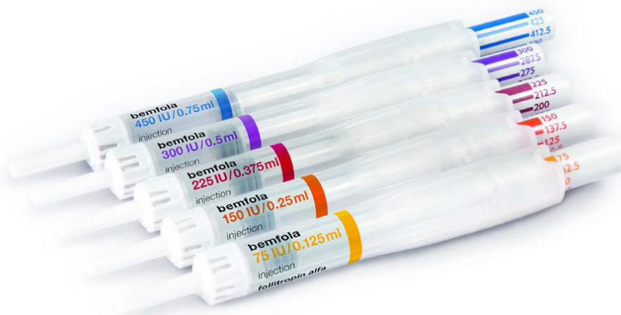
Figure 1: The 5 Bemfola pens containing biosimilar follitropin alfa to the innovative reference product Gonal-f. The specific dosage pens are colour coded being yellow for 75 IU, orange for 150 IU, red for 225 IU, purple for 300 IU and blue for 450 IU.

With respect to choosing the appropriate pen for the rFSH dosing algorithm, it needs to be borne in mind that although 80% of women will not require any change, some cases may require a higher dosage than shown. This has been considered in the colour coding which ensures feasibility for raising the dosage by up to 3 increments for the 75 IU pen and up to 8 increments for the 450 IU pen (Figure 2). For