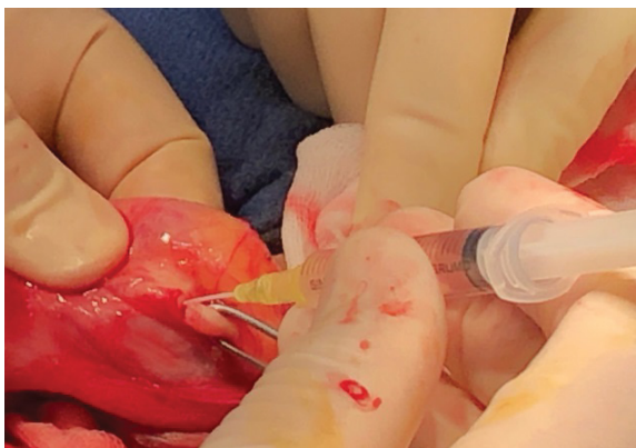
Figure 2: Cannulation of the vas deferens by a 24 g iv cannula enabling a forced retro-flush of the proximal vas (convoluted segment) and cauda epididymis. This picture is taken during an open scrotal dissection but the vas can be easily exposed with a minimal access scrotal incision. Closure of the vas is best performed with microsurgery.