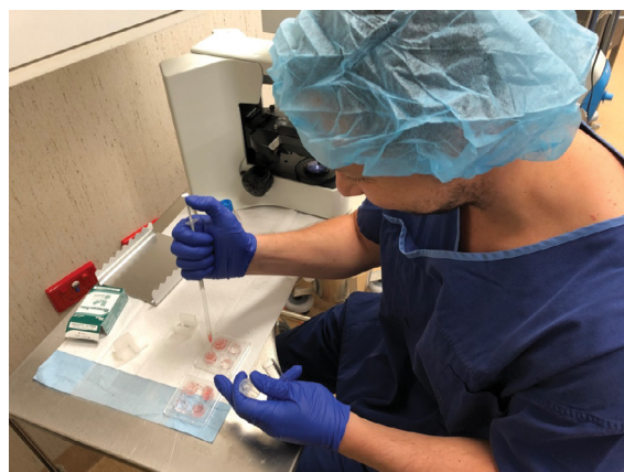
Figure 4: Embryologist sited in the theatre to undertake sperm search from the various specimens derived from MESA, vasal flush and testicular biopsy.

caput epididymis under microsurgical vision X16 with aspiration of light milky fluid in very small samples. These were transferred to a 4-well Nunc dish containing the Hepes-buffered culture medium for the embryologist to identify and collect the samples. Thereafter the incisions were sutured with interrupted 8/0 nylon under magnification x20 (Figure 5).