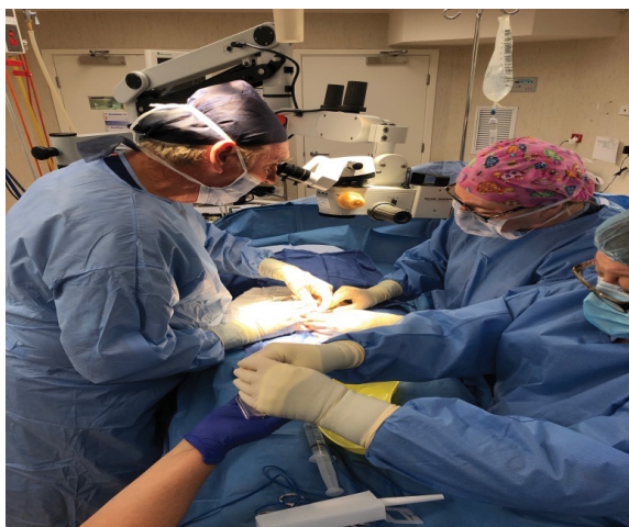
Figure 1: Microsurgical set-up in the day-theatre for open scrotal surgery.

MESA: The technique of MESA involved micro-incision using an ophthalmic scalpel into 3 separate vasa efferential ducts at the